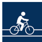
Bike & pedestrian paths