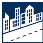
Urban & residential streets