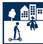
Squares & pedestrian areas