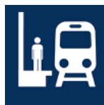
Railway stations & metros