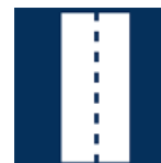
Roads & motorways